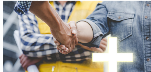
PLUS-warranty for monitors