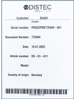
PLUS-label for monitors