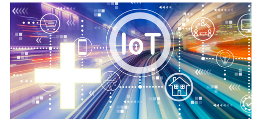
PLUS-software for monitors